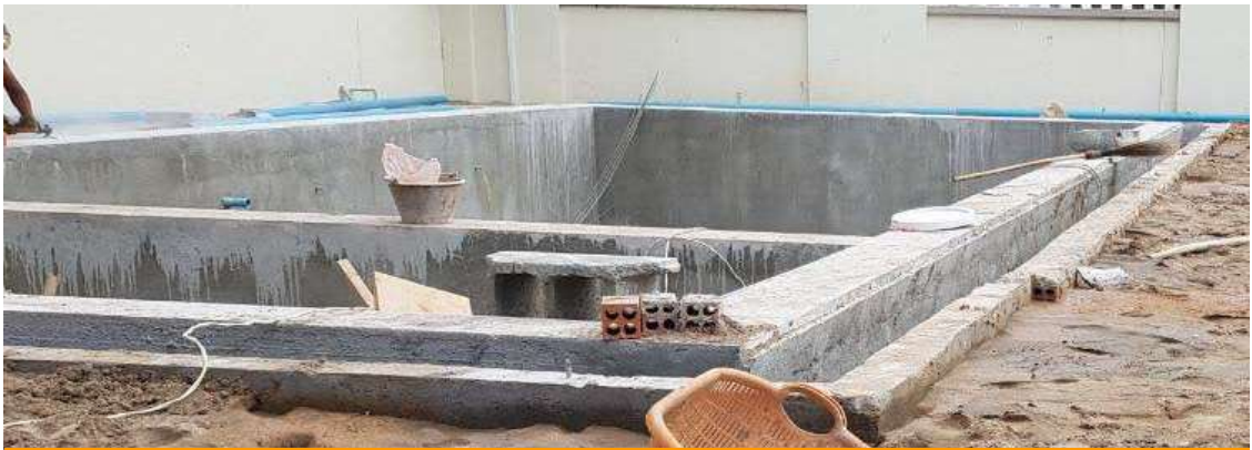
Cast concrete slab and wall together at once