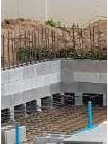
Zoom on T-block