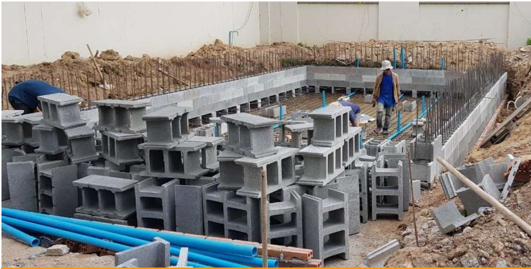
Filling blocks assembly on T-blocks and steel rebars